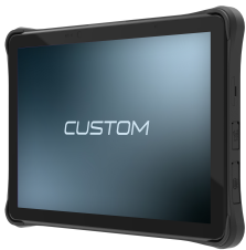
93DHN015900L33 RUGGED TABLET T-RANGER 10.1" ANDR 11 US

Via Berettine, 2 - 43010 Fontevivo PR - P. IVA: IT02498250345 - TEL: +39 0521 680111 - FAX: +39 0521 610701 - CODICE UNIVOCO: 8RQN7AZ