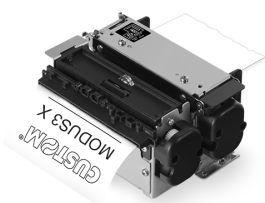
915LF020300300 PRINTER MODUS3 X USB RS232 WITH PRESENTER

Via Berettine, 2 - 43010 Fontevivo PR - IT02498250345 - +39 0521 680111 - +39 0521 610701 - 8RQN7AZ